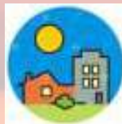
Senior Citizen Homes & Group Homes